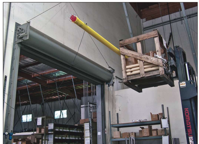
WATCHMAN 2000 - Typical Installation