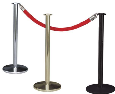
FP-14 rope stanchions shown in standard finishes.