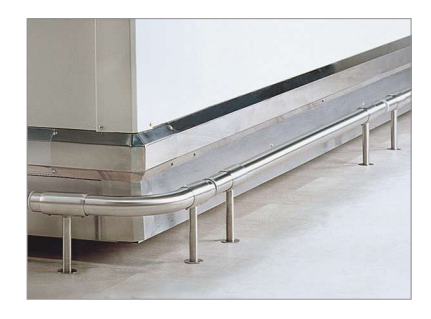
SSB Stainless Steel Bumper System

SSB - Stainless steel bumper system offering quick, easy removal for floor maintenance, and often used in combination with the Defender.