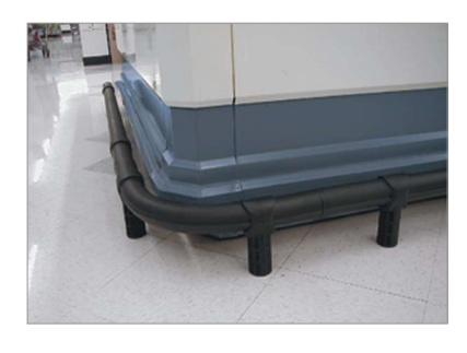
PRO 900 Bumper System in black

Pro 900 - Extremely durable, high-impact plastic bumper system, often used in conjunction with the Defender.