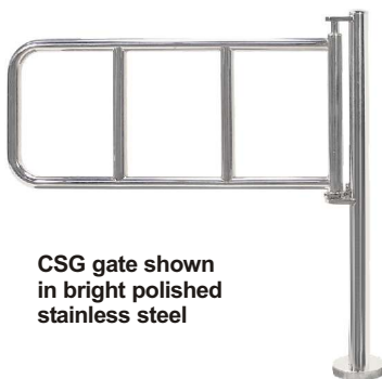
CSG gate shown in bright polished stainless steel