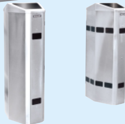
Express Lane Series Optical Passageways. The Express Lane Series features faster throughput for low security environments. These units offer the same technology as our Full Lane Opticals and are enclosed in beautifully crafted stainless steel pedestals.