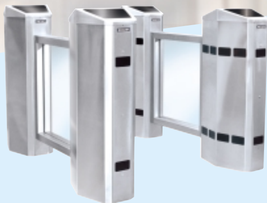
Full Lane Series Optical Passageways. Our Full Lane Series of Waist-High Opticals offer a higher level of security, providing a deeper passageway and greater tailgate detection. These systems include PLC logic, single and bi-directional control, tailgate detection, and high throughput, all in attractive, stainless steel pedestals.

Optical systems, the newest addition to our turnstile line, are a perfect combination of function and aesthetics. These products are designed to look as good as they work. They're a perfect solution for lobbies and other environments to offer low to moderate security for employees and visitors, while maintaining an unobtrusive presence.